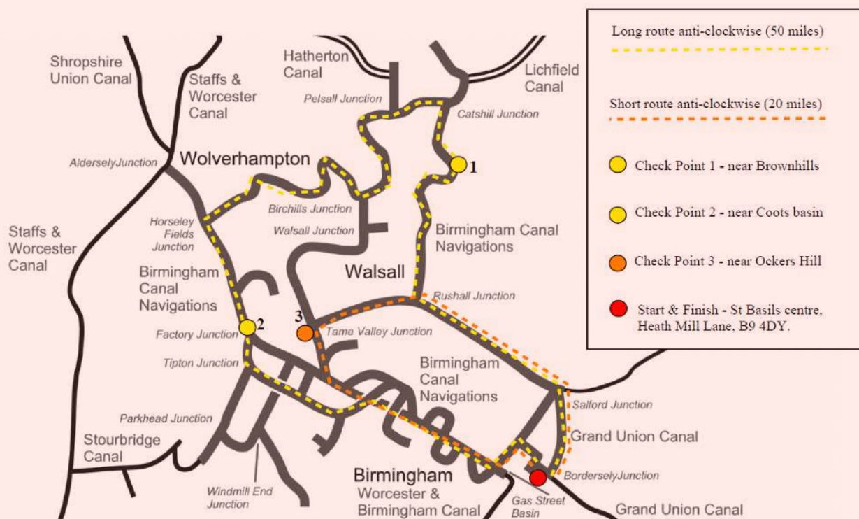
St Basils Canal Cycle Challenge 2025